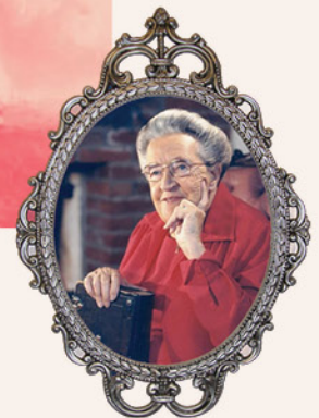
Cornelia Arnolda Johanna "Corrie" ten Boom, along with her family, helped many Jews escape the Nazi Holocaust during World War II by hiding them in her closet.

Her father's wise words gave her comfort, Corrie said while ministering in Africa after the war. "Later I had to suffer for Jesus in a [Nazi] concentration camp. He indeed gave me all the courage and power I needed." Corrie boldly ministered in Christ's love to the prisoners, giving them hope in the midst of their suffering.